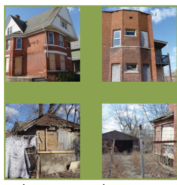
What Does This Detroit Neighborhood Need?