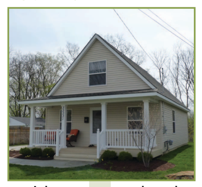
Build a House Like This For a Deserving Family