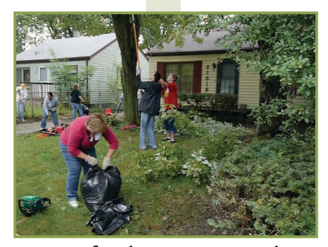
Beautify the Surrounding Neighborhood